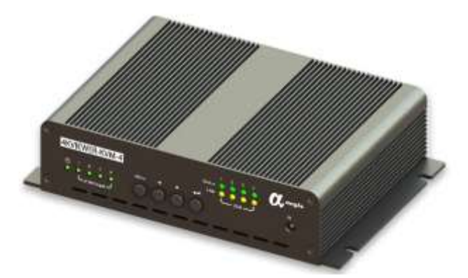
4KVIEWER-KVM-4 Front view

The 4KVIEWER series improves operational efficiency for a wide range of practical applications, including control rooms, monitoring systems, and traffic control centers, as well as process control centers, server rooms, medical industries, broadcasting, production and automation, aircraft and vehicles. In combination with projectors, it is also used in presentations and conference rooms.