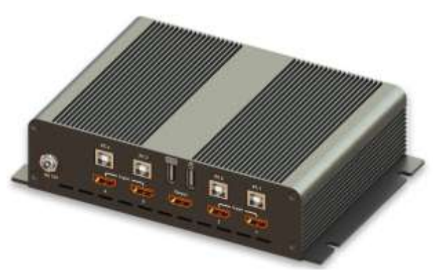
4KVIEWER-KVM-4 Rear view