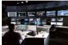
Command and control center